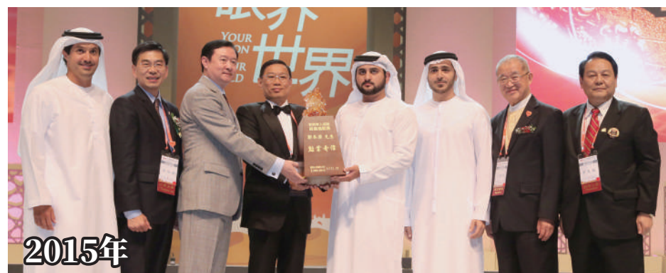
2015年 富邦人寿董事长 郑本源先生