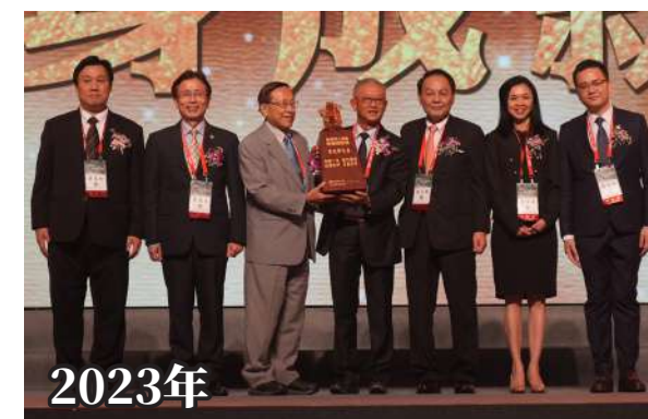
2023年 友邦集团前首席执行官 黄经辉先生