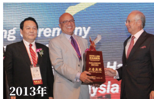
2013年 希克斯全球企业负责人 所罗门·希克斯先生